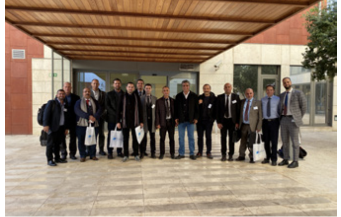
19-21/11/2019 – Participants in the Training on ISPS (Port)