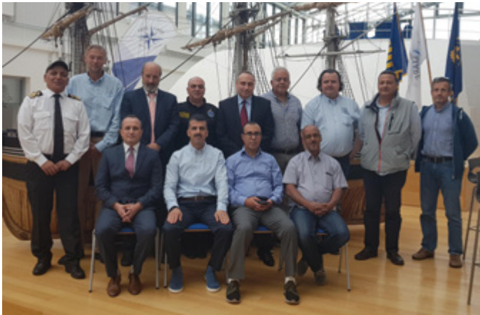
26/8-10/9/2019 – Participants in the Training for VTS Supervisors