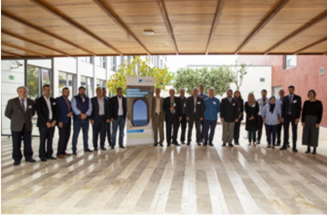
7-10/10/2019 – Participants in 'Enhancing your knowledge on STCW'