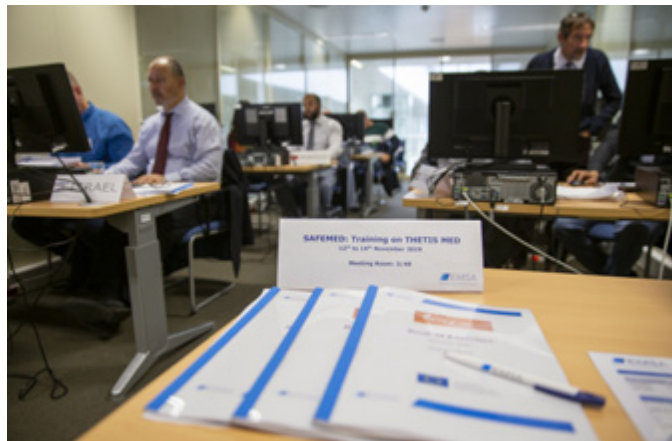
11-15/11/2019 – Participants in the Training on THETIS-Med