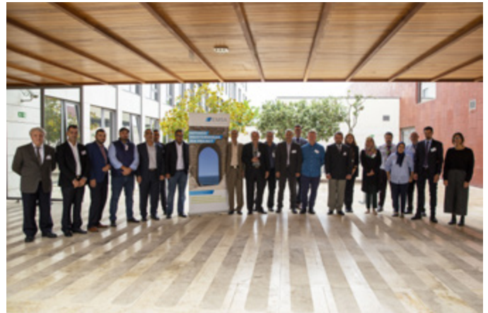
29-30/10/2019 – Participants in the Training on Ballast Water Management