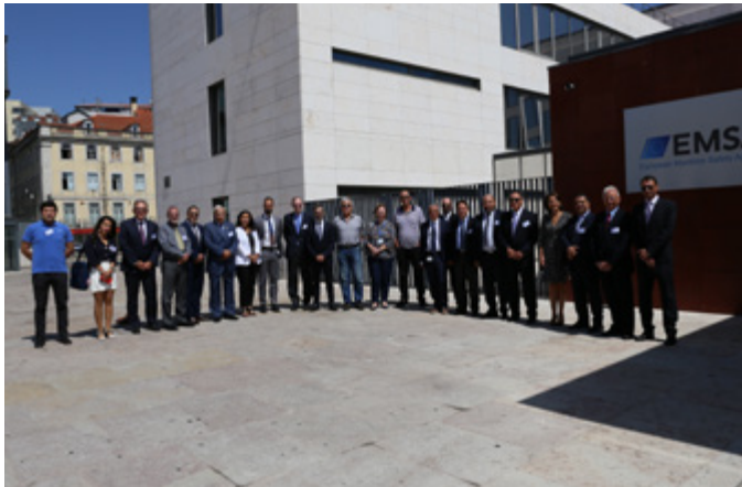
3-4/9/2019 – Group Picture of the 3rd Steering Committee