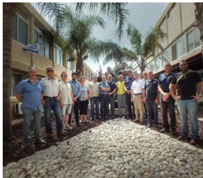
16-17/7/2019 – Participants in the Training on MARPOL Annex VI in Haifa, Israel

November 2019 – Algeria: Study on Port Reception Facilities