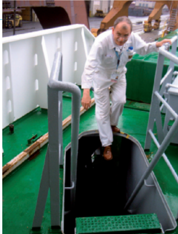
Safety on board: falling into a black hole.