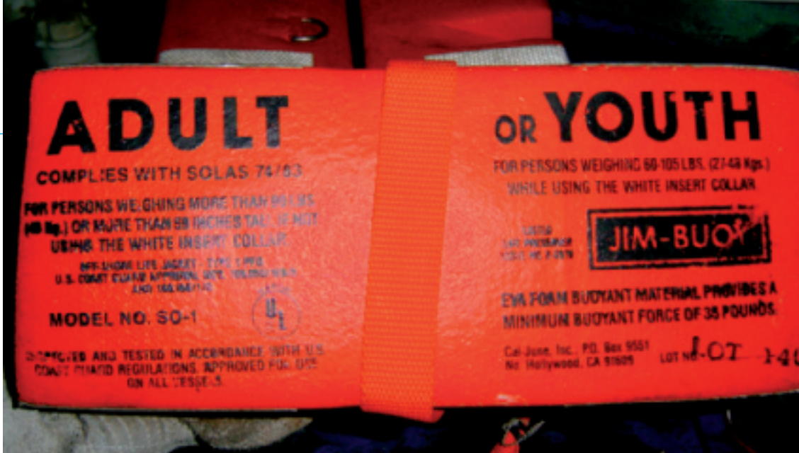
Marine equipment: life vest

the crew, the passengers, or adversely affect the marine environment. The treatment of such cases needs to be carried out within a structured arbitration process, involving an analysis of complaints from the Member States by the Commission. Technical input will be provided to the Commission to facilitate this arbitration process. Based on previous experience gained, the expertise of the Agency will need to be strengthened to be able to review and assess all the documentation related to complaints.