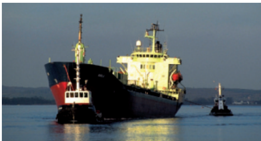
A commercial bunker vessel becoming an oil recovery vessel.

In order to respond to this requirement beyond looking at the legal transposition of legislation, which is the task of the Commission, it is the primary role of the Agency to assist the Commission in verifying the technical aspects of the implementation by Member States. In this context, the visits programme of EMSA to Member States and candidate countries will be intensified. An effective monitoring of implementation is necessary for a number of different reasons. With a large number of Member States and new candidate countries, taking into account diverse