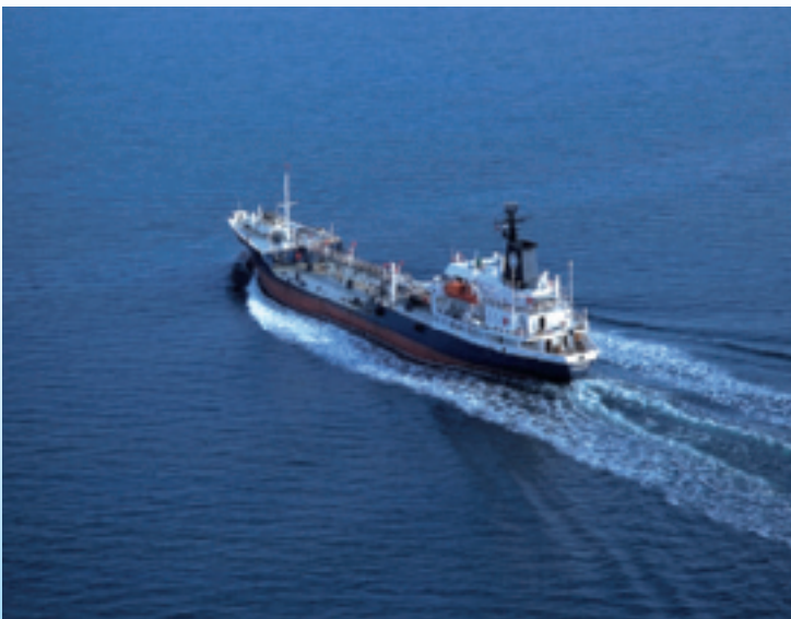
One of the contracted vessels for the Baltic Sea.

to 9,889 m 3 with a total capacity of 29,269 m 3 . Each vessel will be modified to ensure the rapid installation of the specialised oil pollution response equipment from either of the two stockpiles located in Porvoo (Finland) and Copenhagen. The sets of equipment are tailor-made for local circumstances. The northern set includes equipment to encounter oil spills in ice conditions.