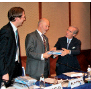
Establishing public-private cooperation.

disasters". Taking into account the large sea areas that will have to be covered and the need for rapid arrival on-site, as indicated, the Agency will organize the second round of the call for tender in 2006 to build up the response capacity as planned.