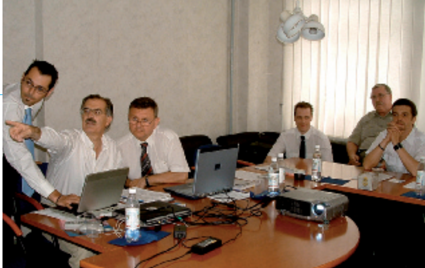
An EMSA training session.

and to connect their national systems to SafeSeaNet. This will allow the participating States and their National Authorities to begin fully communicating and exchanging information on vessel traffic. Technical meetings will be held regularly with Member States in the framework of the SafeSeaNet permanent working group, which aim to review and further develop the system. In addition, possibilities will be examined for integrating other applications and functionalities into the system, and an upgraded version will be developed with availability planned for 2007.