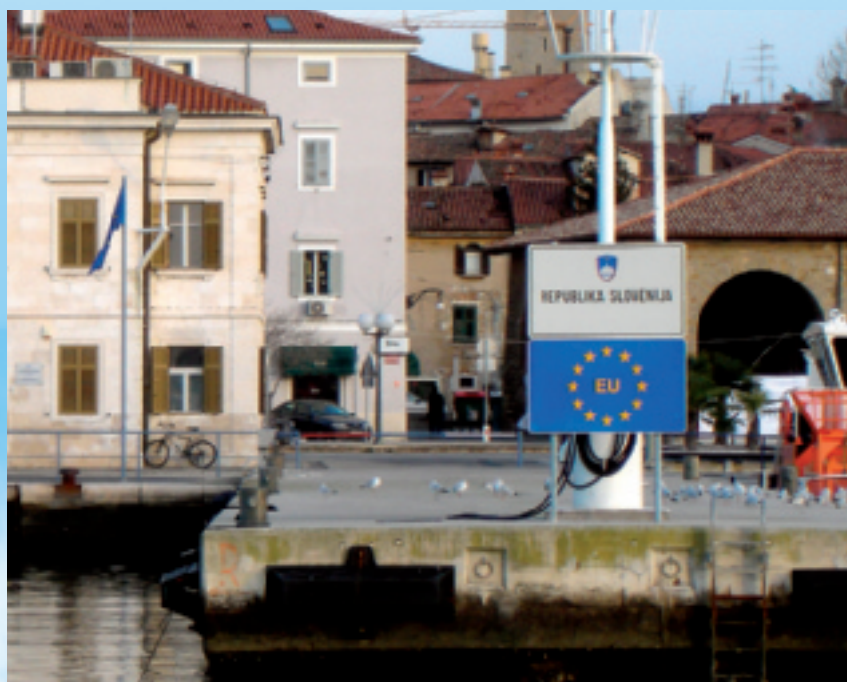
Arriving for training in one of the new EU Member States.

The amount of collected and analysed static information will grow considerably. Information on port state control inspections and detentions, data on accidents, databases on ro-ro ferries and maritime training institutes will be built-up with the ability to be combined and consulted for different purposes.