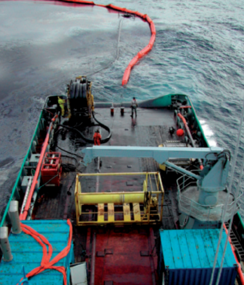
Testing oil pollution response equipment.

be a “logical part” of the oil pollution response mechanisms of coastal states requesting support. EMSA should “top-up” the efforts of coastal states by primarily focussing on spills beyond the national response capacity of individual Member States. In providing this supplementary spill response capacity, the Agency should not replace existing capacities of coastal states nor undermine the prime responsibility of Member States for operational control of pollution incidents.