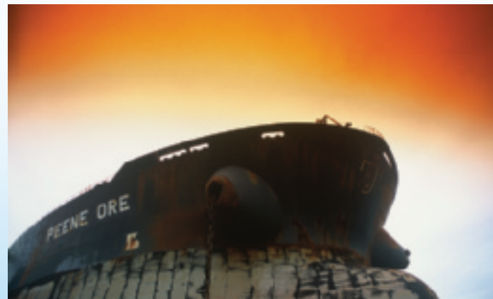
Maritime Safety: a continued challenge ?

In 2005, the Agency started to implement the Action Plan for Oil Pollution Preparedness and Response. A call for expressions of interest was launched in order to establish contracts with industry for stand-by oil recovery vessels, which will be mobilised following a request for assistance from a Member State.