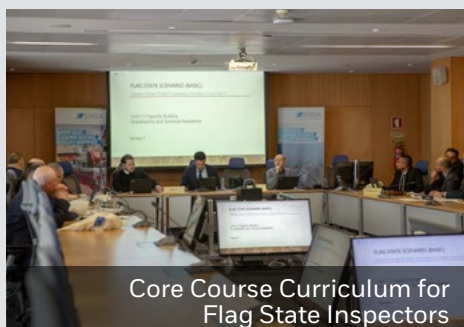
Core Course Curriculum for Flag State Inspectors