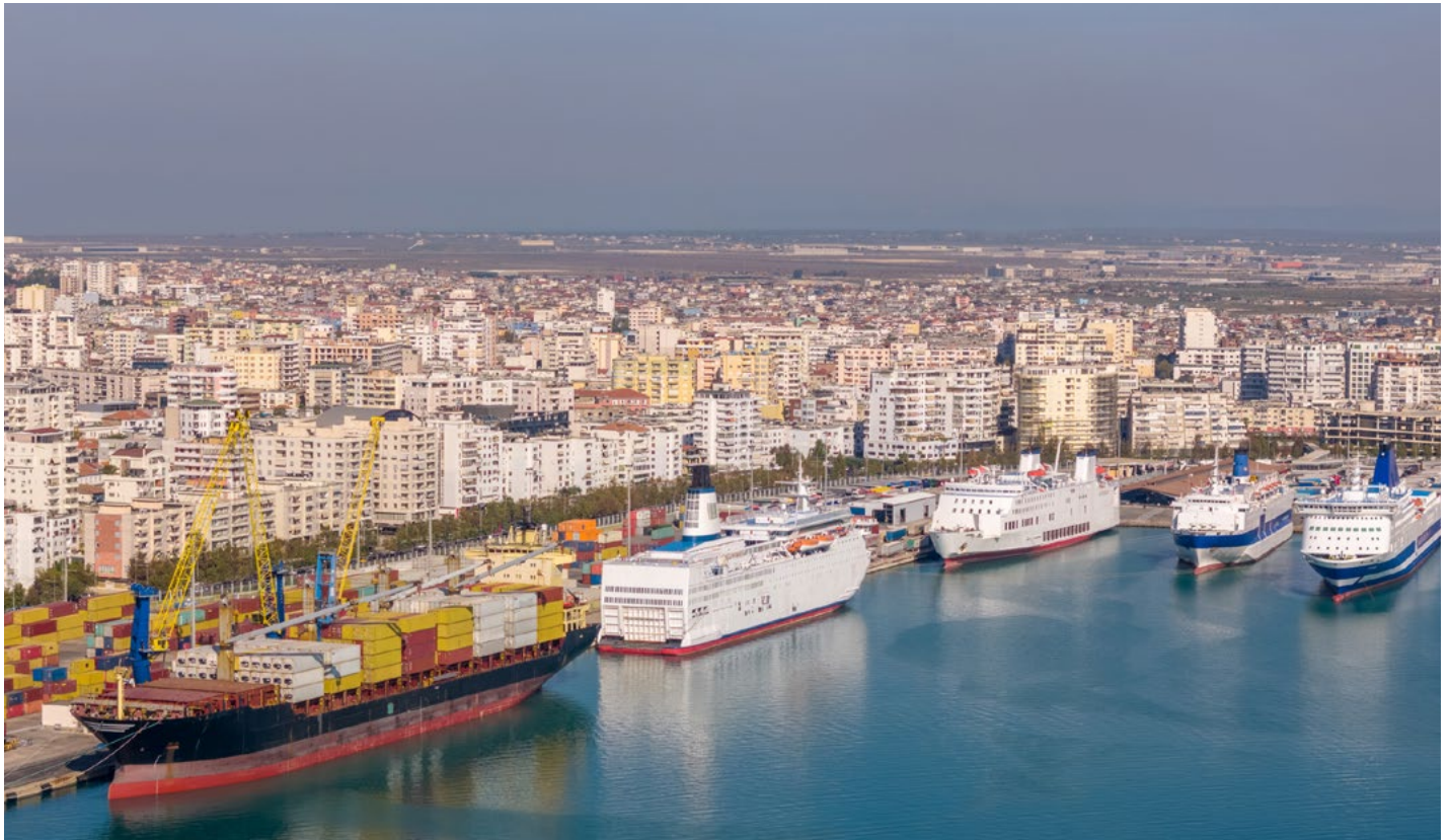
Durrës, Albania