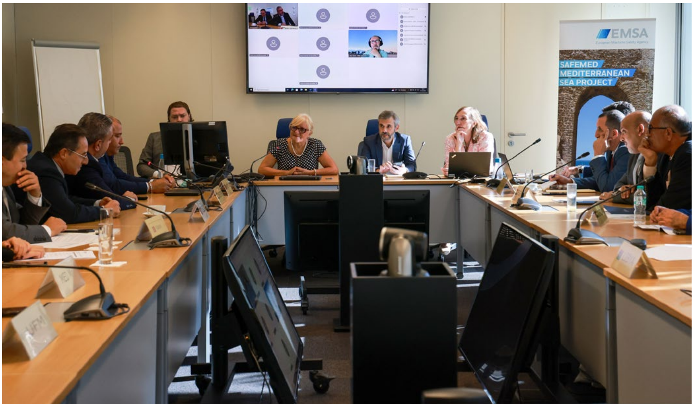
3 rd Steering Committee meeting of the SAFEMED V Project