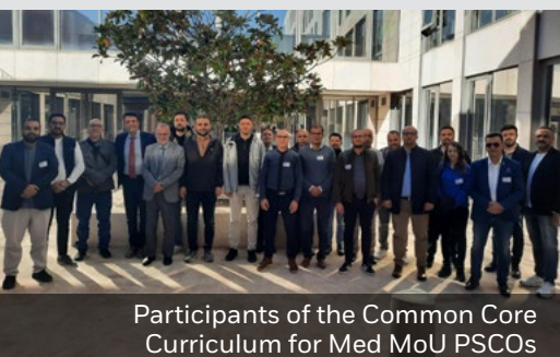
Participants of the Common Core Curriculum for Med MoU PSCOs

The 3 rd Steering Committee meeting of the SAFEMED V Project was held on 1 October 2024 in a hybrid format, facilitating both in-person and online attendance. The meeting was attended by participants from the project's beneficiary countries – Algeria, Egypt, Israel, Jordan, Lebanon, Libya, Morocco, Palestine, Tunisia – as well as Türkiye as an observer. Following the discussion on the project's action plan presented by EMSA, the Committee endorsed the action plan for 2025 and the possible learning services to developed by the EMSA Academy in 2026.