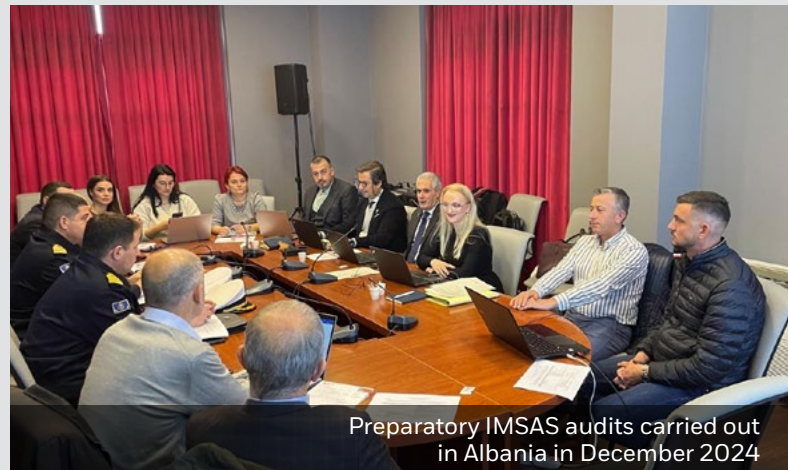
Preparatory IMSAS audits carried out in Albania in December 2024