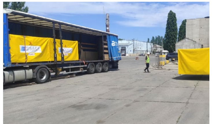
Oil Pollution Response equipment donated to the Ukrainian Sea Port Authority