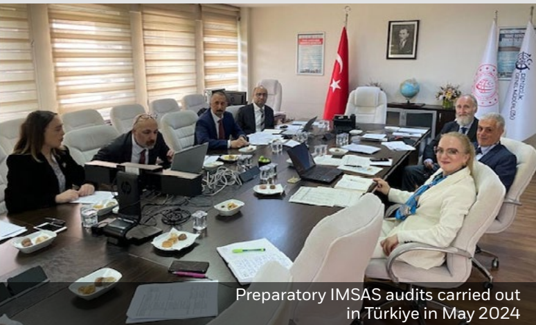
Preparatory IMSAS audits carried out in Türkiye in May 2024

Utilising an external expert selected from the Agency’s dedicated database, the project supported Montenegro in drafting the implementing procedures for the national Search and Rescue (SAR) plan enabling the country to enhance and rationalise the SAR organisation at the national level.