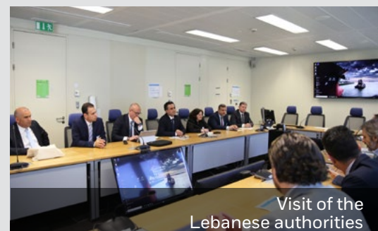
Visit of the Lebanese authorities