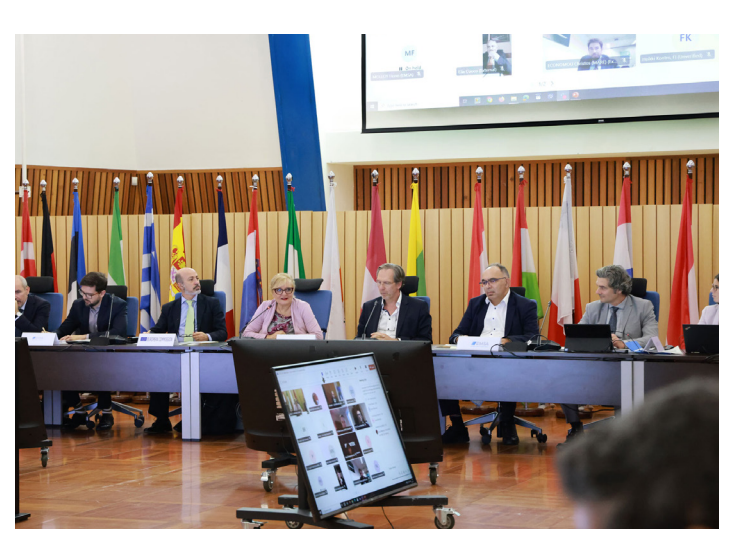
Stakeholders gathered from around the EU to attend the CISE meeting held at EMSA's headquarters.