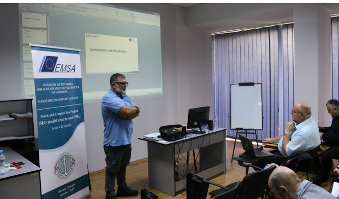
14-17/10/2019– Georgia: IMO model course on OPRC level 2

The IMO OPRC Level 2 training course was mainly focused on the principles of the incident command system, the efficient implementation of contingency planning appraising spill impacts and environmental sensitivity, the main guidelines for safe and effective execution of oil spill response operations as well as the legal and compensation regimes.