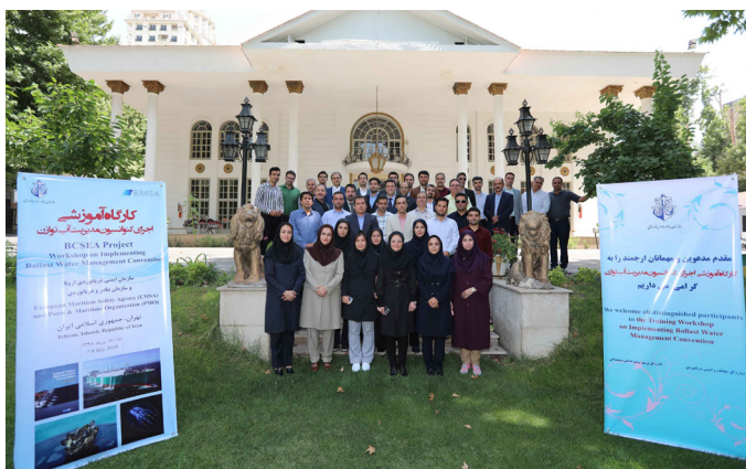
29-30/10/2019 – Participants in the training course on Ballast Water Management

A training course on the implementation and compliance with the requirements of the International Convention for the control and management of ballast and sediment from ships, 2004 (BWM 2004) was organised in co-operation with the Ports and Maritime Organization (PMO) of the Islamic Republic of Iran from 7 to 8 July 2019 in Tehran. The participants were provided with detailed information regarding the framework for compliance, monitoring and enforcement of the BWM Convention, an update on Ballast Water treatment technology, the PSC view of control, and sampling and type approval of BWM systems.