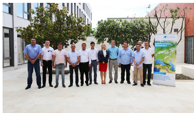
2-3/07/2019 - Training for MLC, 2006 Inspectors

25-26/09/2019 - Project Seminar on Search and Rescue