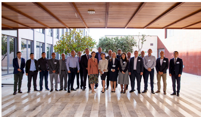
21-25/10/2019 - Training for auditors under IMSAS