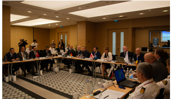
11-12/09/2019 - 15 th Black Sea SAR Conference

This was the opportunity for EMSA to present the tools to assist SAR Authorities, which provide a full maritime picture to improve the effectiveness of the SAR activities. The conference highlighted the importance of SAR cooperation between national authorities of the Black Sea.