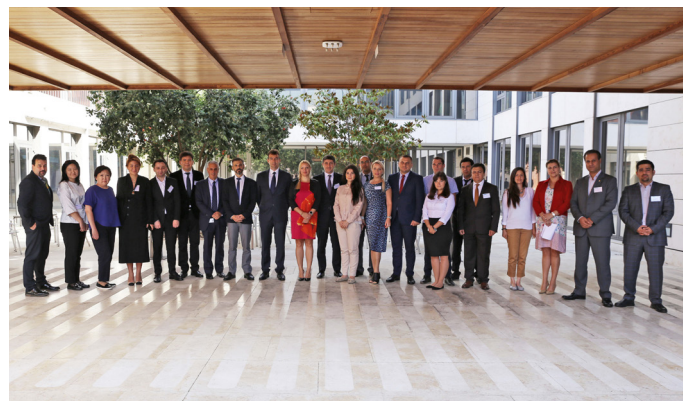
18/09/2019 - 3 rd Steering Committee meeting

Azerbaijan, Georgia, Iran, Kazakhstan, Moldova, Turkmenistan, Turkey and Ukraine, DG NEAR, as well as the Commission on the Protection of the Black Sea Against Pollution participated in the Black and Caspian Sea regions project 3rd Steering Committee at EMSA premises in Lisbon. It was the opportunity to provide their priorities and expectations for bilateral and regional activities for the timeframe 2020 - 2021 and these were reflected in the project's Action plan subsequently approved by the Steering Committee.