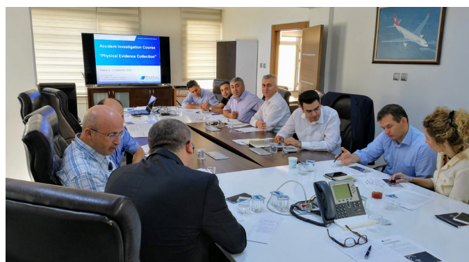
9-13/09/2019 – Turkey: Core Skills for accident investigators

On the request of Turkey’s national maritime administration, a Core Skill Course for Accident investigators was carried out in Ankara. It introduced all relevant stages in the process of conducting a marine casualty safety investigation and raised the technical capacity of the Turkish accident investigators.