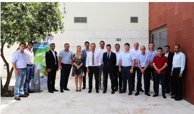
16-17/07/2019 - Training on ISPS