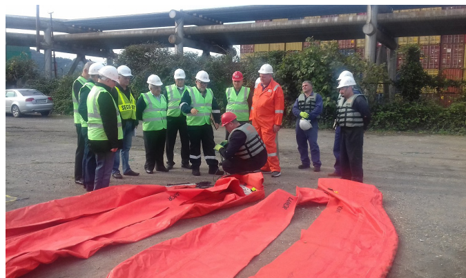
7-10/10/2019– Georgia: IMO model course on OPRC level 1

IMO OPRC training courses provided the opportunity for Georgia’s both Incident Command System and Emergency Response team members to reinforce their knowledge and skills in the oil spill response and preparedness mechanism. During the IMO OPRC Level 1 training, participants had the opportunity to familiarise themselves with the available oil spill response techniques and equipment by introducing guidelines for their use and the limitations, practice their response equipment, as well as comprehend the main health and safety hazards and precautions.