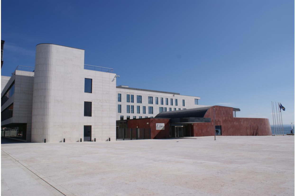
Photo: EMSA's headquarters on the Tagus estuary in central Lisbon

Commission, made it possible for most provisions in the NIR and in the Directive to be identical. In short, common standards, Paris MoU-wide.