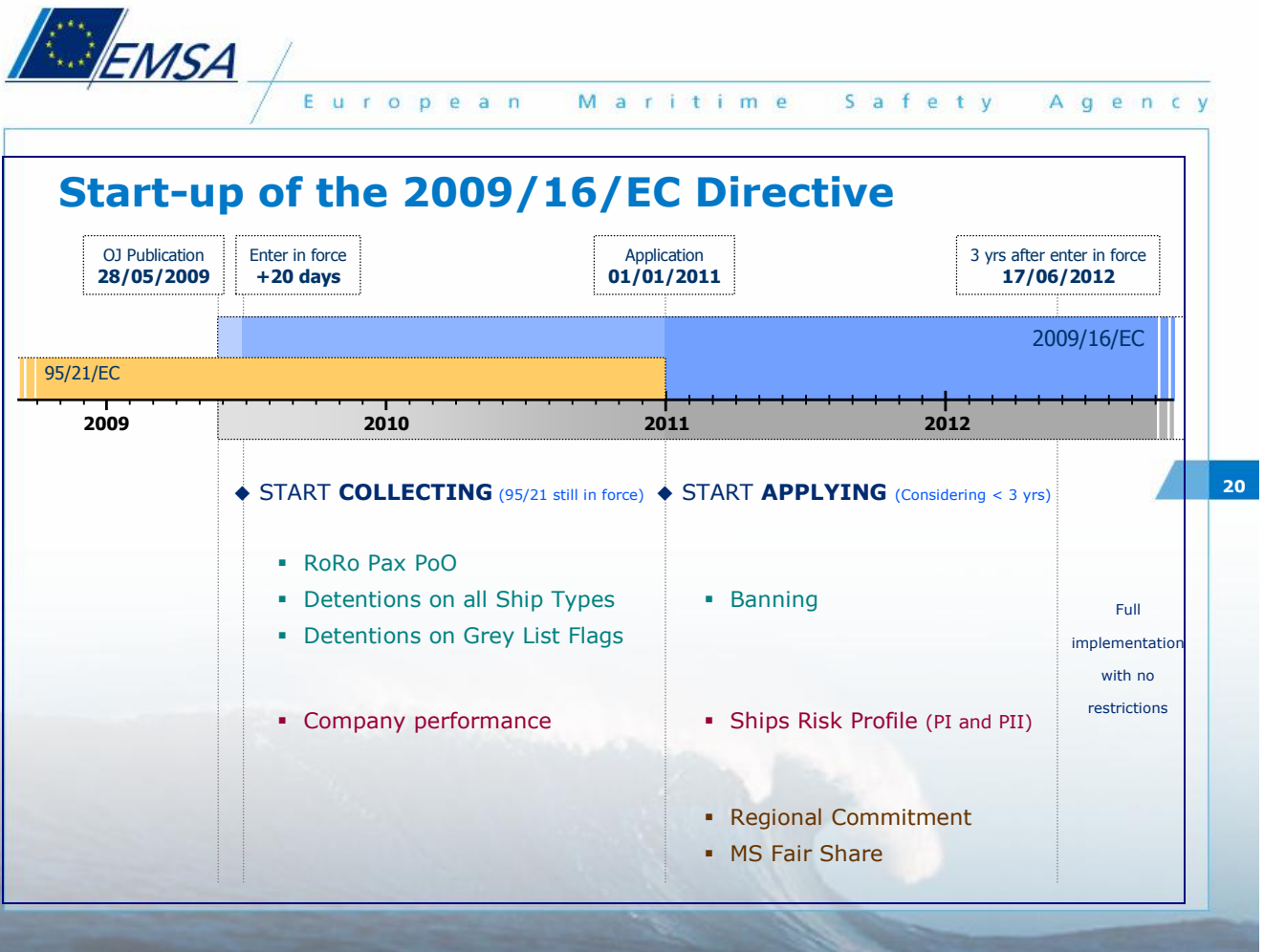
Image: The collection of information for the NIR began in June 2009, while application of the rules begins in January 2011.

Although, the Directive's transposition period expires on 1 January 2011, it is important to note that the Directive officially entered into force on 17 June 2009. Therefore, application of the new Directive's