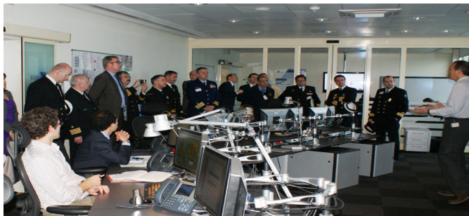
Offering support 24/7 for maritime monitoring systems

Experts attending the North Atlantic Coast Guard Forum ( NACGF ) took time out to pay a visit to EMSA's Maritime Support Service operations centre on 2 April. The visitors - both civilian and military, representing 17 different countries - gained insight into how EMSA collects and brings maritime information to EU Institutions and countries. NACGF's goal is to increase cooperation among member States on matters related to maritime safety and security in the North Atlantic region. It organises working group meetings on subjects such as fisheries enforcement; illegal drug trafficking; illegal migration; maritime security; search and rescue; and, technical matters.