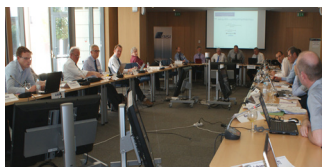
Sea Europe participates in the MarED Group for the first time

EMSA hosted the 26 th meeting of the MarED group on 17-18 April. Thirty one attendees participated in the exchanges which notably outlined new recommendations for the harmonisation of conformity assessment procedures. These recommendations must now be examined and endorsed by the Committee on Safe Seas and the Prevention of Pollution from Ships (COSS). The MarED group provides a cooperation platform for Notified Bodies designated by EU countries to carry out conformity assessment in line with the Marine Equipment Directive . The meeting also welcomed as a first-time observer the new association of European shipbuilding and maritime equipment, Sea Europe . Sea Europe was formed through a merger between the European Marine Equipment Council (EMEC) and the Community of European Shipyards Association (CESA).