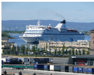
National single windows - improving information exchange

The support offered by SafeSeaNet is expected to grow as EMSA embarks on a new pilot project under the framework of the Integrated Maritime Policy. Assisting other user communities and helping member States to share reporting formalities information via a 'single window' are the main prongs of this initiative. While the first will be addressed in a study, the second will involve the setting up of a 'demonstrator'. As part of the demonstrator project, certain software and service components will be developed to simulate a National Single Window. The aim of this single window will be to aid in the distribution of data to national authorities and in the sharing of information via SafeSeaNet's central system. To gain experience, EMSA approached member States with knowledge of the National Single Window. Finland, Norway, the Netherlands and Portugal together with the European Port Community Systems Association, EPCSA and the port authority group, Protect , shared their valuable experience with EMSA. The e-Freight and e-Mar project coordinators will also be consulted. The demonstrator project will test different National Single Window solutions and interfaces to help member States implement Directive 2010/65/EU.