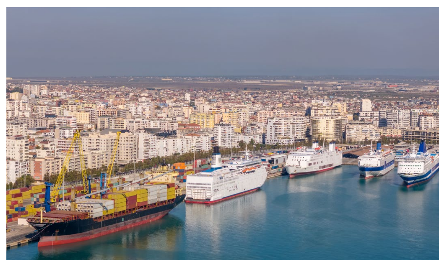
Durres, Albania