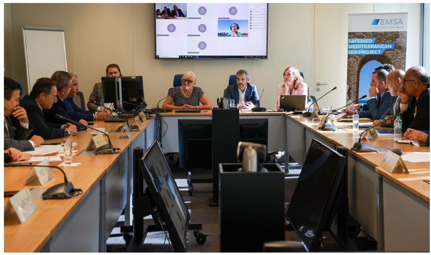
3<sup>rd</sup> Steering Committee meeting of the SAFEMED V Project