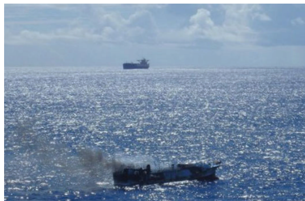
Three days after the first satellite image was delivered, the wreck was identified by a merchant vessel

On 4 November the wreck of the vessel was identified by a merchant vessel, the M/V STI OCHARD, and the updated position was sent to the Taiwanese authorities.