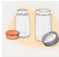
Glass bottles with inert lining in the lid