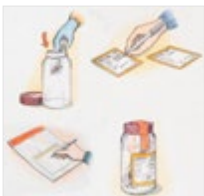
Sampling documentation and seals