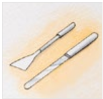
Stainless steel spatula, stainless steel scraper or PTFE scraper