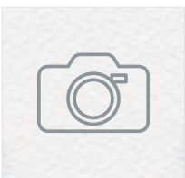
If available: camera for photo/video