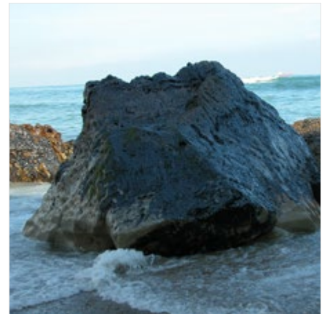
Example of locations to be sampled