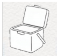
Transport container (insulated and cooled, if needed)