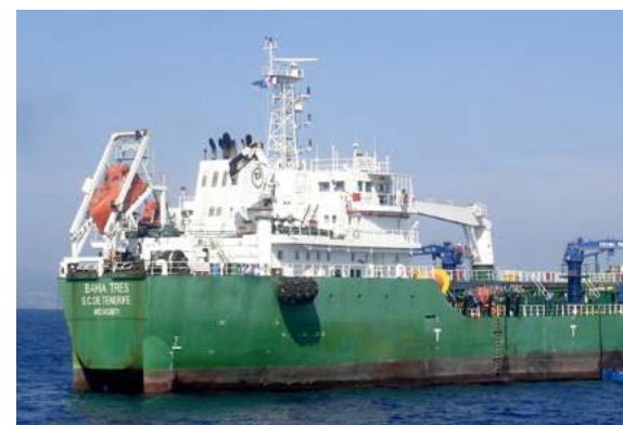
Slick detection system