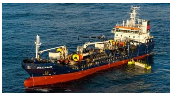
Slick detection system