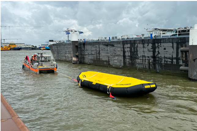
Hands-on EAS training in The Netherlands brought together equipment operators from all over the EU and EFTA

EMSA recently organised a hands-on training course in Werkendam in the Netherlands for equipment operators from EU/EFTA Member States. Over the course of three days, representatives from Belgium, Finland, France, Germany, Latvia, Sweden, and The Netherlands were trained on the use of selected oil pollution response equipment systems that are part of EMSA's Equipment Assistance Service (EAS). The EAS can top-up Member States' capacities to respond to a pollution event at sea and is part of the toolbox of pollution response services that EMSA maintains in full operational readiness.