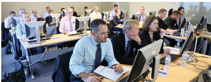
Getting valuable feedback from the member states

A new module of the THETIS inspection database is now in place to support member states as they begin to enforce the latest directive governing the sulphur content of ship fuel. The decision was confirmed during EMSA's June 2014 Administrative Board and the cooperation agreement signed between DG Environment and EMSA in August 2014. An initial set of screens including a list of rules was presented to member states for review and validation during a workshop in September. The comments and ideas gathered are being used to enhance the module whose development took place rapidly to meet the entry into force of the directive (1 January 2015). On 15 December, THETIS was upgraded to contain the new module and member state representatives were invited for a test session as well as for training and familiarisation. The module has been live since 1 January 2015, and development and improvement is ongoing.