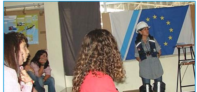
Portuguese school pupils learn about the EU and EMSA

On 22 May the European Commission organised in Portugal a new 'Back to School' initiative involving EMSA's Portuguese staff. The project encourages EU officials to go back to their old schools for a day and talk with students and teachers about the European Union. Portuguese pupils and students were able to learn about the role of the EU institutions, the enlargement, the Lisbon Treaty, gender equality and, naturally, a particular Lisbon-based agency involved in enhancing maritime safety.