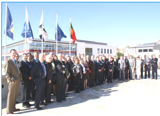
Judges and accident investigators at the well-attended event

On 24 November 2009, EMSA hosted a symposium on Judicial and Safety Investigations into Marine Casualties, the first of its kind. High level Member State representatives from both judicial and safety investigation authorities attended, debating the issues associated with conducting both types of investigation, in light of the new Accident Investigation Directive 2009/18/EC . Case studies were also provided, to assist participants in preparing the effective implementation of the Directive by June 2011.