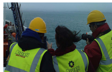
Journalists were invited to see first-hand how EMSA tests its contracted oil spill response vessels.

Each year EMSA carries out around 50 drills and exercises on its contracted network of Oil Spill Response Vessels . These drills are crucial to ensuring that equipment and crews are adequately prepared to respond in the event of a major oil spill. On 15 June, EMSA organised a press visit on board the vessel MV Sara , based in Portland (UK), which covers the Channel and Atlantic approaches sea area. Press representatives joined the visit from the French publications Le Marin , Ouest France and Mer et Marine , together with the UK's RNLI (Royal National Lifeboat Institution) , the British search-and-rescue charity, headquartered in nearby Poole). Under rainy skies, the drill included technical information from the contractor, Aegean Bunkers, inflatable boom and skimmer deployment with an assisting tug, together with the testing of sweeping arms. More press visits are likely to take place during future drills.