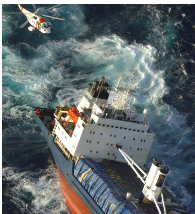
The fourth in a series begun in 2007, the Maritime Accident Reviews provide an overview of commercial shipping accidents occurring in and around Europe. The photo shows the sinking of the North Spirit off NW Spain in December 2010; (source: SASEMAR).

The latest issue of the most popular document on the EMSA website is now online. The Maritime Accident Review 2010 , the fourth in the Agency's series of statistical and analytical reports on commercial shipping accidents in-and-around EU waters, has just been released. This year's review reports a small increase in the number of accidents in Europe – 559 accidents and 61 lives lost – up from the 540 accidents and 52 lives lost reported for 2009. However, these figures are considerably below the figures reported for 2007 (715 accidents, 76 lives lost) and 2008 (670 accidents, 82 lives lost). The mild increase of 3.5% in accidents reported for 2010 possibly reflects the recovery in shipping traffic and volume during the year. Indeed, the marked decline in accidents reported for 2009, in comparison to the economic boom years of 2007 and 2008, suggests that there is a link between maritime accident numbers and economic activity. This year's Review includes full maps of accidents reported during the year, plotted against their geographical locations, enabling readers to see accident trouble spots and patterns. The document can be downloaded from EMSA's website .