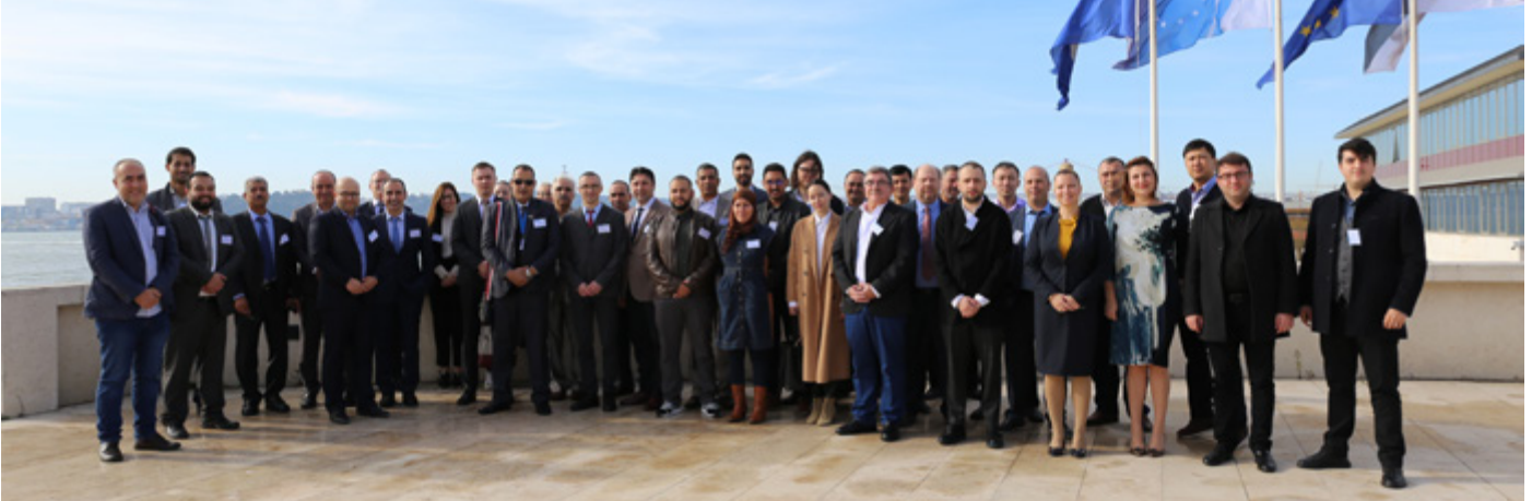
5-6/02/2020 Training for MLC, 2006 Inspectors