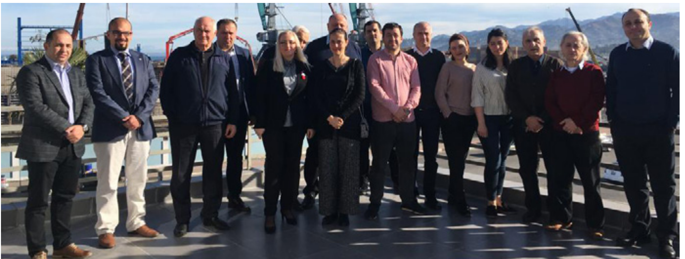
4-5/3/2020 Georgia, Batumi: BCSEA Project in-country Training on Places of Refuge

The training session provided an opportunity to the fifteen participants to get acquainted with the topic and the existing Guidelines at the introductory level as well as