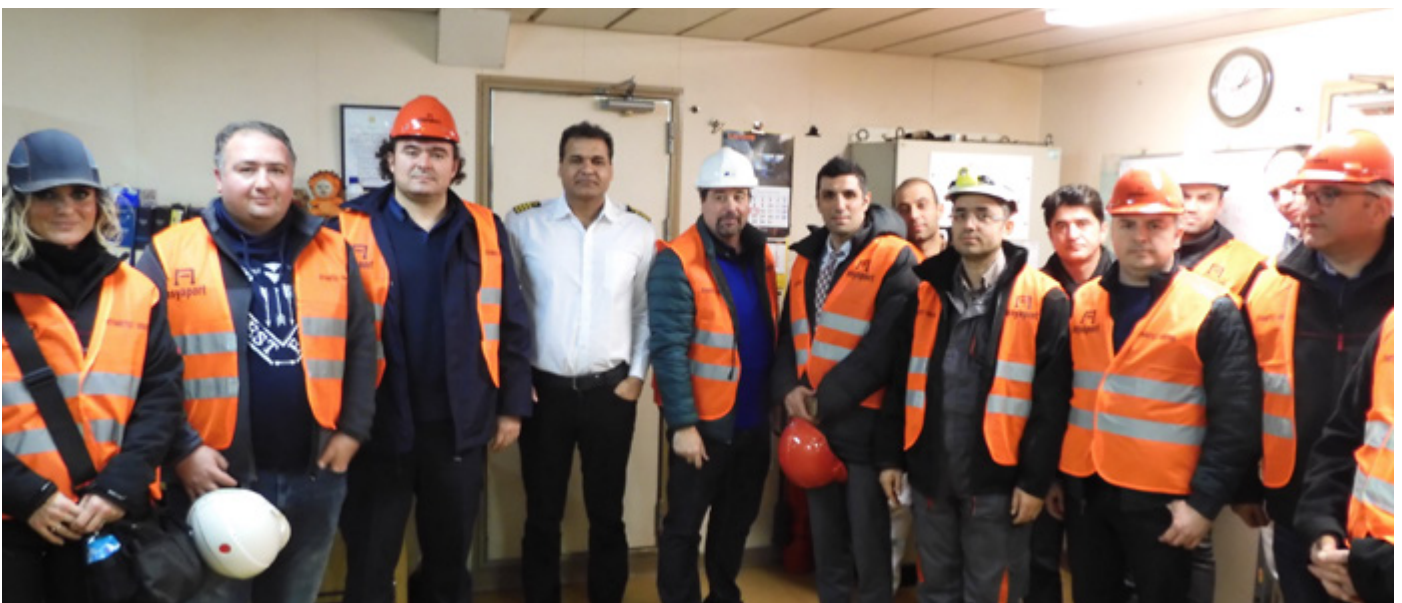
13-15/01/20– Turkey Training on MARPOL Annex VI

Nineteen participants were provided with detailed information regarding the framework for Compliance Monitoring and Enforcement of the BWM Convention, an update on Ballast Water Treatment Technology, the PSC view of control, monitoring and enforcement of the BWM Convention, sampling and type approval of BWM systems.