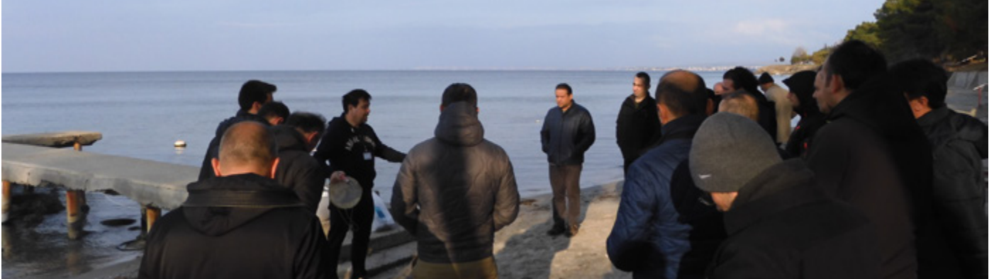
20-21/2/2020 – Turkey: Training on Ballast Water Management Convention

A training program on Places of Refuge was designed and delivered by EMSA following a request on behalf of the Maritime Transport Agency of Georgia. The training was an introductory session on IMO and EU Operational Guidelines on Places of Refuge addressed to officials responsible for developing and implementing a national