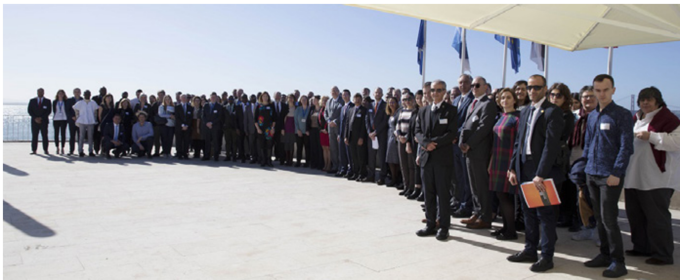
19-20/02/2020 International Workshop on the implementation on MLC, 2006

An additional activity implemented by the Agency in this field was the organisation of a Training course for MLC Inspectors, which took place from 5 to 6 February 2020 at EMSA premises. The overall objective of this training was to provide a thorough overview of the MLC including its amendments. 16 representatives of staff from the maritime administration involved in labour conditions on board ships attended the training.