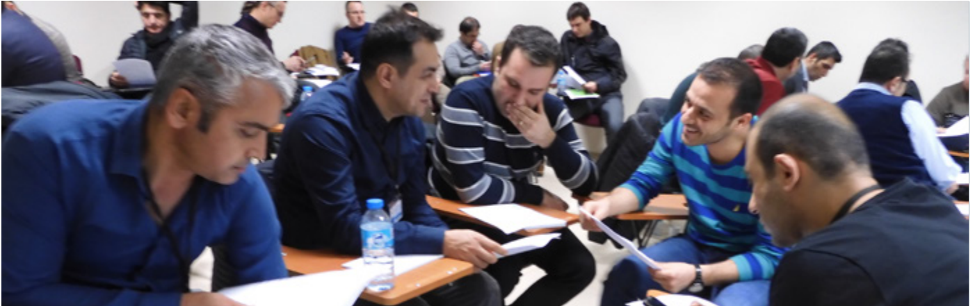
13-15/01/20– Turkey Training on MARPOL Annex VI

Alternative Fuels and the use of Emission Abatement Systems.