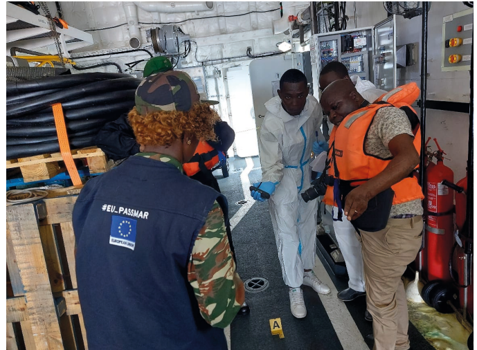
Audaz exercise in Gabon

Copernicus is the Earth Observation component of the European Union's Space Programme which looks at our planet and its environment for the benefit of all European citizens. It offers information services that draw from satellite Earth Observation and in-situ (non-space) data. The European Maritime Safety Agency (EMSA) is the Entrusted Entity responsible for implementing the Copernicus Maritime Surveillance service on behalf of the European Commission (DG-DEFIS).