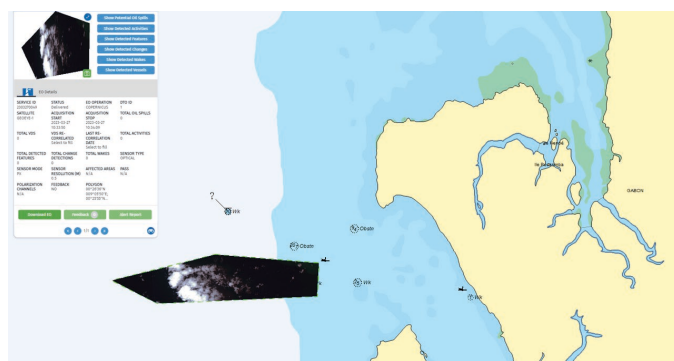
CMS optical image provided in the context of the sea exercise