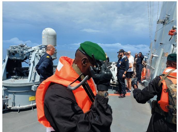
Audaz exercise in Gabon