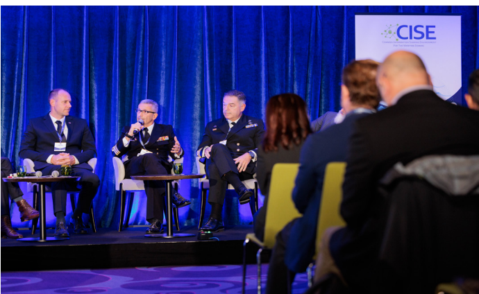
Delegates discussed the evolution of CISE and its future role in maritime security in the EU.