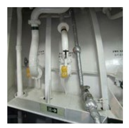
Discharges/outlets to sea

The piping plan is used to locate all possible outlets (including the ballast water system) which should be subsequently checked for suitable sampling points. The tank arrangement plan should also be checked to identify the different possible tanks to sample. Additionally, the Oily Water Separator should be examined to identify if it has been - or is - malfunctioning. The records in the ORB should also be checked against its use. Furthermore, soundings of bilge tanks, sludge tanks and dirty oil tanks should be taken and the incinerator, if fitted, should also be checked in order to match its use with ORB records.