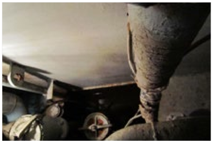
Oily water on the bilge