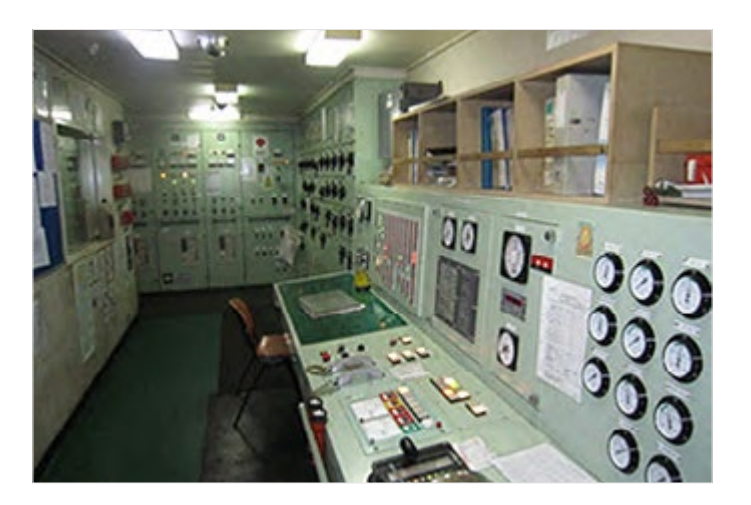
Engine control room

relevant areas of a ship for oil sampling, namely tanks, the engine room and bilge (including bilge pumps; oil/water separator, purifier etc.)