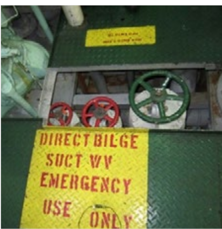
Emergency bilge pump valve