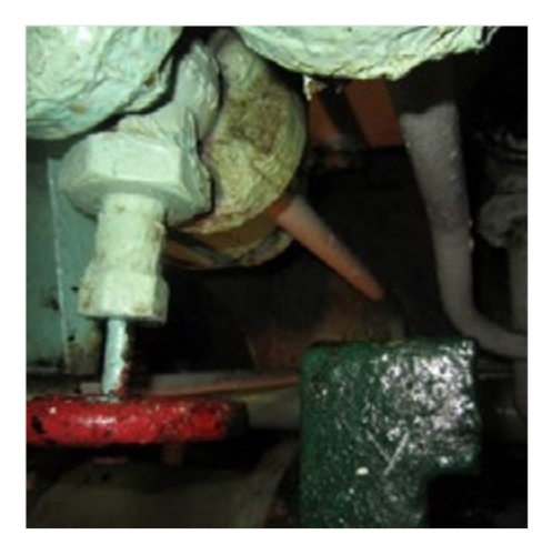
Oily Water Separator