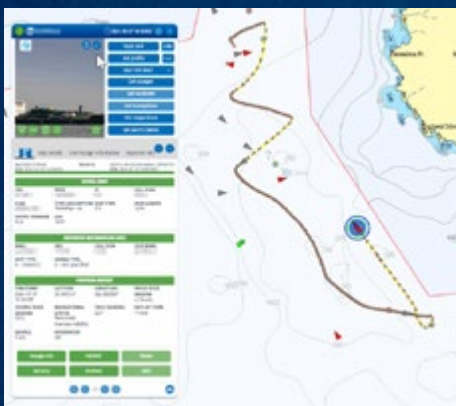
Vessel making a sudden change of heading as detected by ABM in near real time