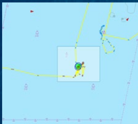
Two vessels meeting in at sea encounter detected by ABM in a specific area of interest