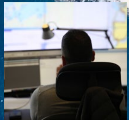
Operators can select behaviours to monitor, define areas of interest and select alert methods