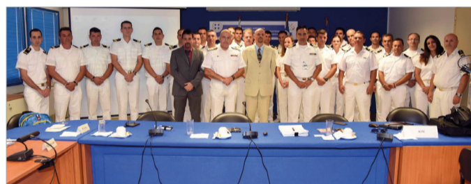
The course also included practical exercises on enforcement

In cooperation with the Hellenic Coast Guard, EMSA held a training course in Piraeus on 10-11 September on implementation and compliance in relation to the International Convention for the control and management of ballast and sediment from ships. The course was delivered by EMSA representatives and was attended by officers from central port authorities and directorates of the Hellenic Coast Guard. The topics covered included: detailed information on the BWM Convention; an update on ballast water treatment technology; the PSC view of control, monitoring and enforcement; and, sampling and type approval of BWM systems.