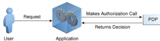
Figure 1-3 Application Acting as PEP Requests Decision from PDP

8.2 Are all authorization requests to OES initiated by applications (figure 1-3) as described in Appendix 5 (page 37) and using the java library (OES Wrapper) mentioned in Appendix 9? Or are there other scenarios in which the requests are intercepted by OES Security Modules and authorization is performed before reaching the applications (figure 1-5)?