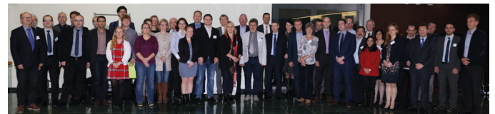
EMSA has been providing technical assistance on ship recycling since 2006

EMSA held a workshop on the Ship Recycling Regulation on 19-20 November, gathering 42 participants from 21 EU countries, the European Commission and experts from industry. The main topics addressed were: hazardous materials on board ships; the development of the inventory of hazardous materials for new and existing ships; implementation of the relevant provisions of the Ship Recycling Regulation by member states as Flag and Port States. Various issues were raised during the meeting such as implementation and enforcement challenges; interaction between the regulation and international instruments; ensuring harmonised implementation; and, areas for further assistance from EMSA.